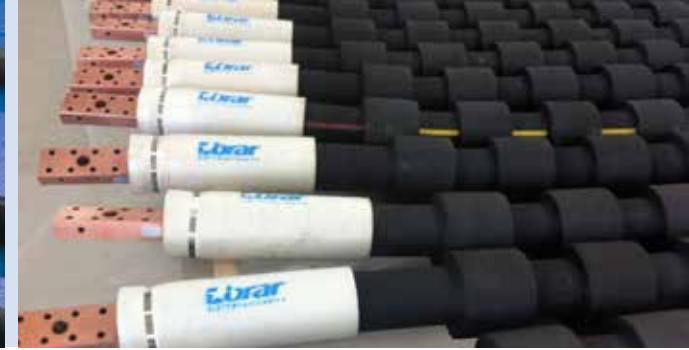
Arc furnace cables